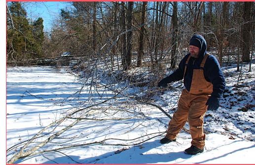
All Saints' Episcopal Center, Leitchfield, KY